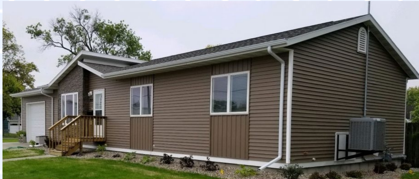
Region 6 project